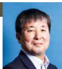
教授 成田 史生 Professor Fumio Narita

Design, development and evaluation of multi-functional composite materials