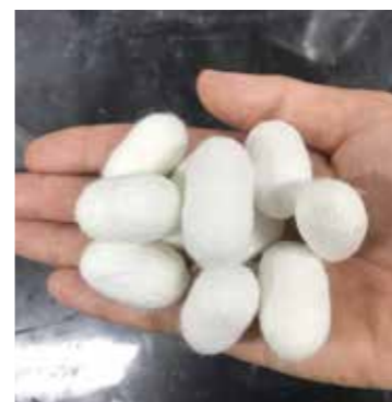
Fig. 3 Cellulose nanofiber reinforced cocoon of a silkworm.

that converts impact into electricity. Furthermore, we are investigating the changes in resonant frequency and output power of magnetostrictive composites caused by material adhesion, aiming to develop magnetostrictive virus sensors (see Fig. 2).