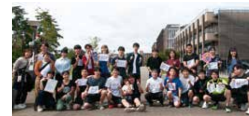
Fig. 4 Group photo of summer trip