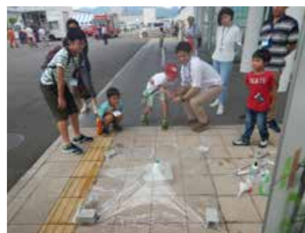
Fig.6 Outreach activity at FREA Open-day