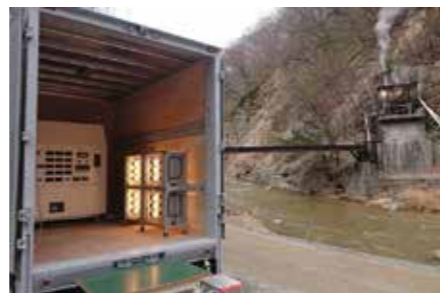
Fig.3 Field test of binary power plant for hot springs