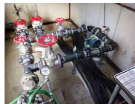
Fig.4 Monitoring system of hot springs for coexistence of geothermal power generation and hot springs