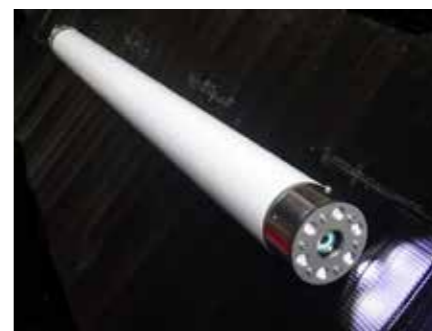
Fig.5 A prototype of borehole scanner for geothermal wells